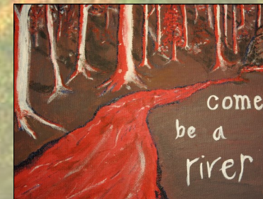
Painting by Risa Tillman; inspired by the poem “Milos” by Anis Mojgani

Conclusion: Due in part to the Enlightenment, we use language as if we are isolated minds, distant from the world around us and from our own bodies. Poetry, the lexical land where grass is still green and where we can still hear its sway in our souls, can serve as a remedy, reminding us that we are creatures—made to be participants within the created order and lovers of the Creator.