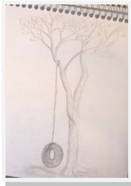
Pencil Drawing: Tire Swing, Geneva College Quadrangle

The wind blows harder, our souls grow heavy, coming of age is not what it seems. Taste its sweet fruit, forget what you saw. How could there be beauty in a place that's so dark?