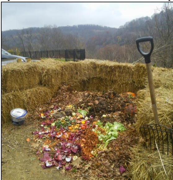
The compost pile in Fall 2014.

Learn more about composting by searching the GreenFile database: bit.ly/1AGZ2rK . You might learn more about what can be composted, with articles such as http://bit.ly/1xQJteO . You can also research the scientific process of composting with articles like http://bit.ly/1J39akT , which analyzes how coffee grounds may affect the nutrients in the finished compost.