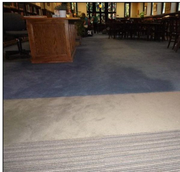
The new floor color in the Buhl Reference Center, from the foyer.

Replacing carpet in a library is a major task. In addition to moving furniture, all the books on the shelves must be moved and replaced. We are grateful for the physical plant crew who carried out this work over Christmas break! In addition, the electricians removed and re-routed some power outlets for our copiers and computer workstations. Now that the work is done, these rooms look fresh and welcoming. Come and enjoy the new décor!